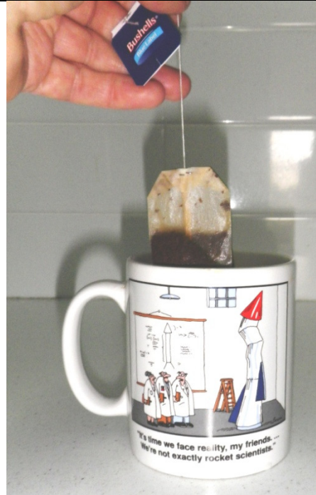
It's not rocket science

Draw a labelled sketch of other household examples of filtration below.