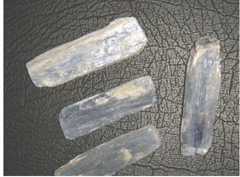
Kyanite - its name means "blue"

In most metallic ores colour can be a useful clue to mineral composition. Green and blue often indicate copper whilst red usually indicates iron. With crystals trace elements can cause great variety of colour differences. Colour should only be used in freshly broken rock.